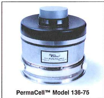
PermaCell™ Model 136-75