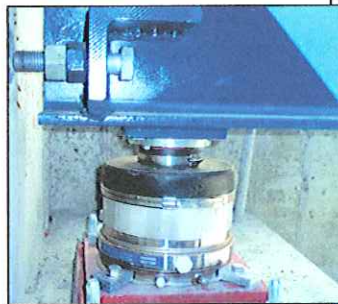
Series 136 PermaCell™ beneath the weighbridge.